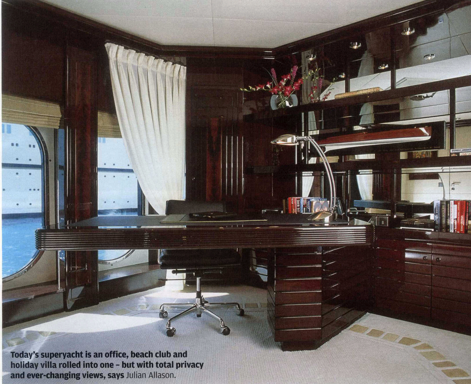
Today's superyacht is an office, beach club and holiday villa rolled into one - but with total privacy and ever-changing views, says Julian Allason.