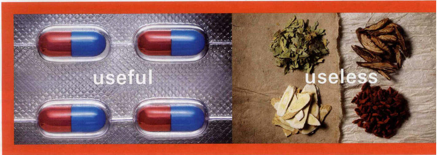
Issued by HSBC Holdings plc.

sometimes remained murky. Private jet holiday operator Jeffersons has introduced fixed-price packages for yachts based in three popular European cruising centres: the French Riviera, Naples for the Amalfi coast and Sardinia. This can work out at a relatively modest £21,000 for four days for six people including private jet flights and limousine transfers. Helicopter connections are also offered. There is the further option of extending the holiday by combining it with hotel stays. On the Costa